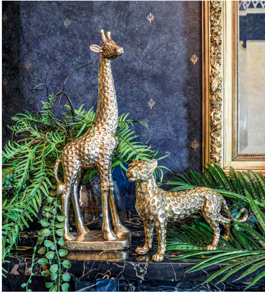
GOLD GIRAFFE STATUE